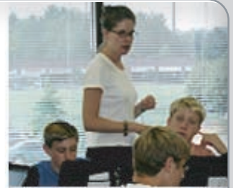
Teachers share lesson plans and activities about heroes and heroism.

The Teacher's Room includes lesson plans incorporating the study of heroes and the use of the MY HERO Web site for all grade levels.